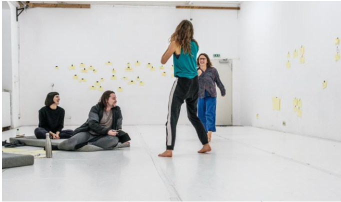
Image: Meeting Points II artists